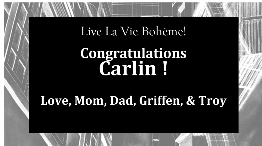
Third Page Horizontal (2.5" x 4.5"), Standard Layout