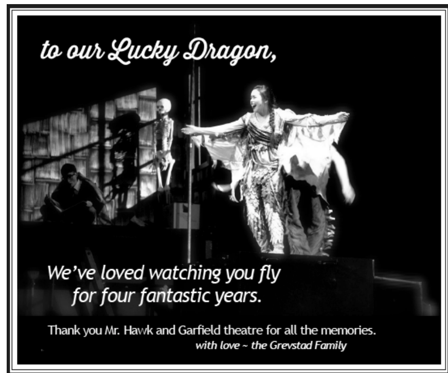
Half Page (3.75" x 4.5"), Parent-designed Layout