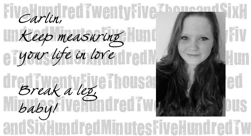
Third Page Horizontal (2.5" x 4.5") Standard Layout With Custom Font

If you feel pretty confident about using a Word template of one of our standard layouts (replacing photos and text with yours), you can download the templates from our website. Or create your own ad! For non-standard layouts or custom fonts, please be sure to send the ad in JPG or PDF format. (Please no Illustrator, PhotoShop, Publisher, etc. files)